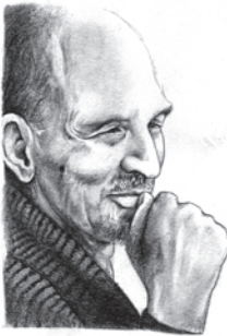
Ingmar Bergman 1918-2007

Ingmar Bergman is a well known Swedish director of films noted for their starkness, their subtle use of black and white and 'shades' of those extremes, the ambiguity of their content, and a certain brooding presence that seems to pervade them all. The list of Bergman films is long; his best known include The Seventh Seal (1957), Wild Strawberries (1958), The Virgin Spring (1960), The Silence (1963), Persona (1967), The Passion of Anna (1970), and Cries and Whispers (1973)—this last film in colour, though emphasising red in all its shadings. In the following selection, the Introduction to Four Screen-plays by Ingmar Bergman (1960), Bergman discusses how he views the art of film-making.